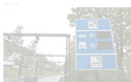
STOPPSTAND. Vi ser hva gode bollebrø, øl og ferskvannsløst redningsutrustning på forholdet til og kjølne forhøyet av en dynamisk miljø-transport og miljø-transport.

Miljøavtaler som skal gjøre norske byer bedre, renere og mer moderne, vakler nå under økende bompengerotstand.